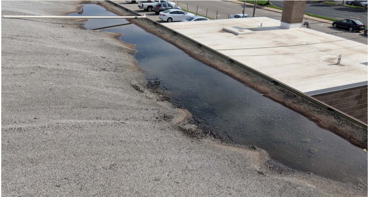
One small portion of the damaged roof.