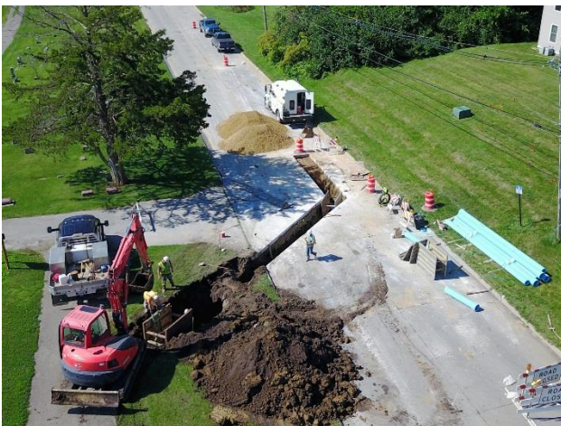
Construction of new water transmission main down North 6th Street, looking south.

The City of Monmouth is currently undertaking several very important major infrastructure projects to position the community for future growth and to avoid potential problems. The City recently drilled a new water well on Jackson Avenue and is currently constructing the water transmission main down North 6th Street to deliver this source of fresh water to the municipal water treatment facility located at the North Water Plant between E. Harlem and E. Girard Avenues. This project will ensure residents and businesses alike a safe and adequate supply of drinking water for decades to come.