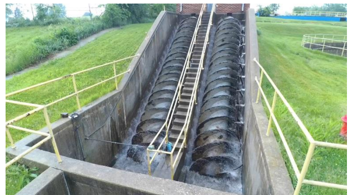
Existing screw pumps in operation at municipal combined sewer overflow facility.

north wastewater treatment plant capacity. This project will address state and federal mandates requiring municipalities to discharge properly treated and clean effluent into adjoining surface waters such as creeks and rivers. Once these new screw pumps become operational, the City will upsize the pump station that will pump the captured wastewater in the storage lagoon to the north wastewater treatment plant once the flow has decreased after a rain event.